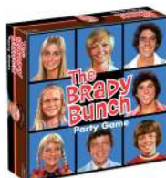
3/4 Angle Box